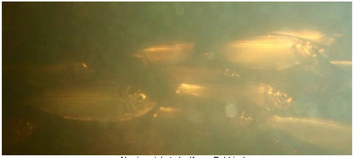
Alewives

If these measures are unsuccessful, the town may have to restrict the number of visitors at any one time by limiting parking spaces and passing a punitive parking ordinance. We hope this doesn't become necessary. In the meantime, on very hot days when lots of people crave a swim in the pond, please consider making your visit brief, and don't linger after your swim.