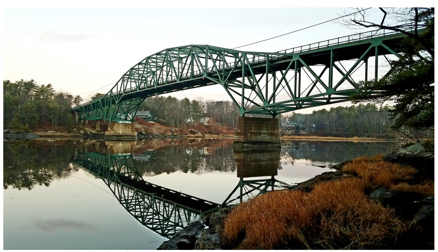
Bridge Over Calm Waters