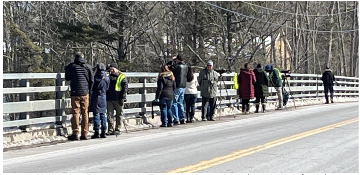
Bird Watchers Eagerly Await the Eagle on the Rte 127 bridge

You can follow the latest sightings at Maine Audubon and tune in to an Audubon webinar on the eagle.