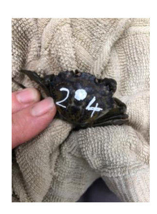
GC 24 marked 8/4/22

carapace with towel and/or hair dryer, apply white acrylic paint and dry again before releasing the crab. The acrylic paint pen allows precise markings. How exactly would we mark each crab? We contemplated symbols and numbers for trap location, project day and a combination thereof that included sequence numbers to help us identify specific individuals.