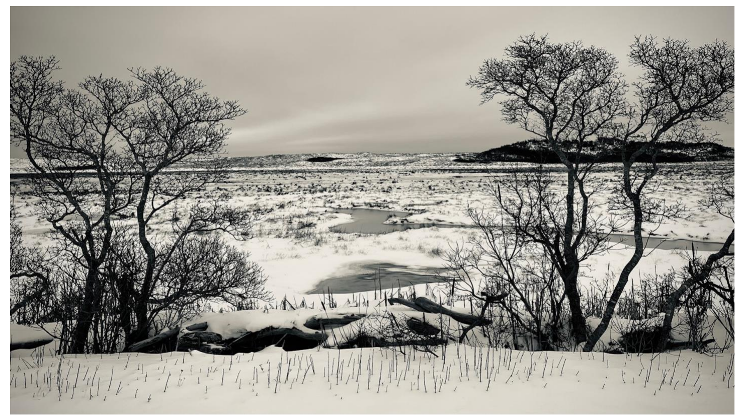
Reid State Park