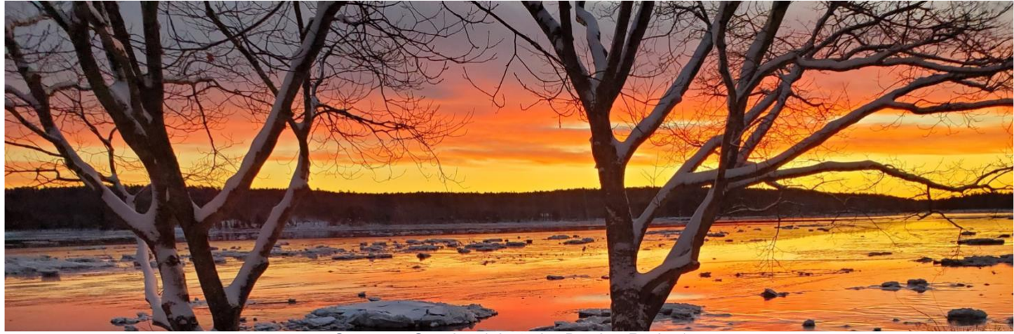
Sasanoa Sunrise