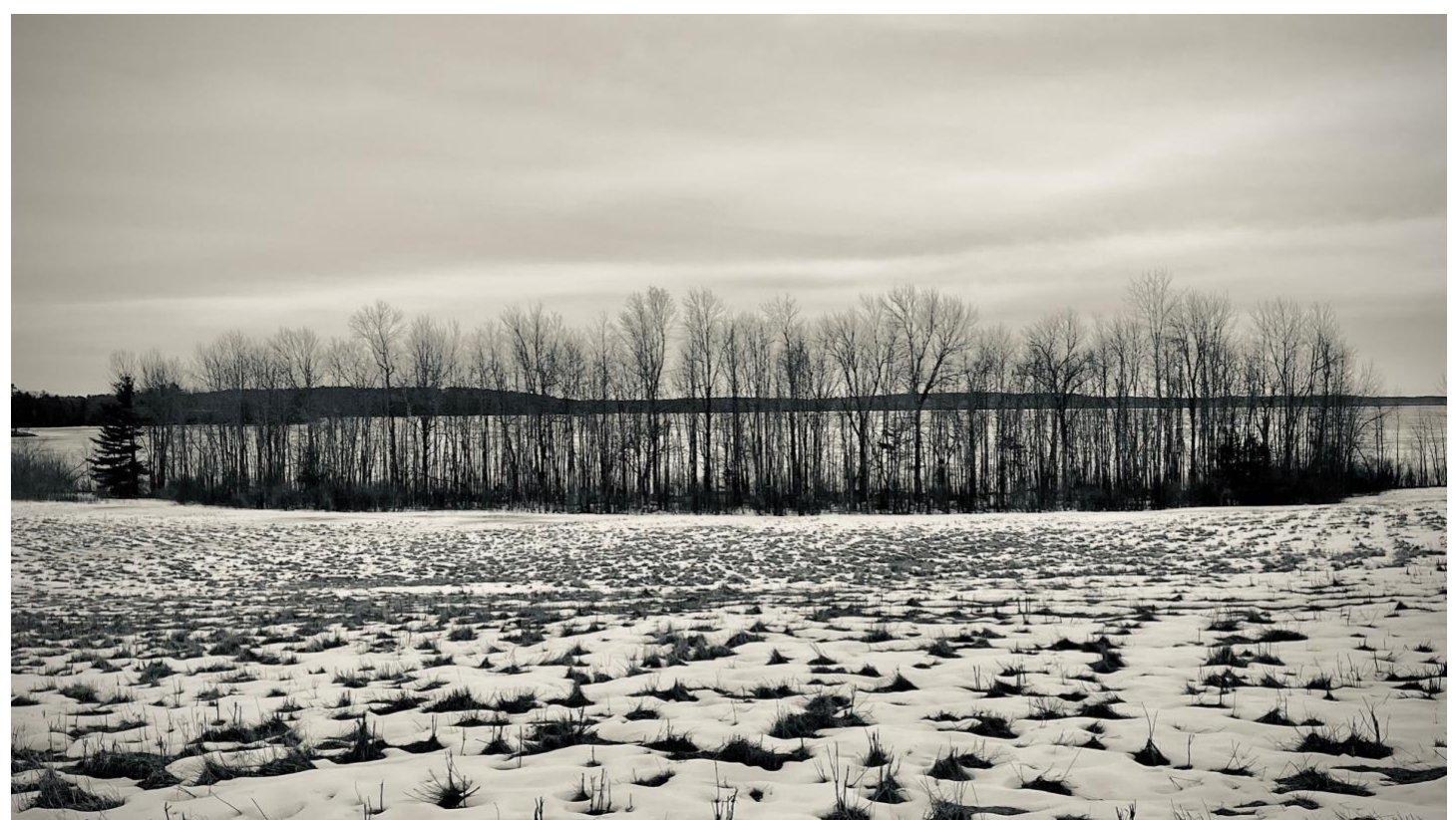
Merrymeeting Bay