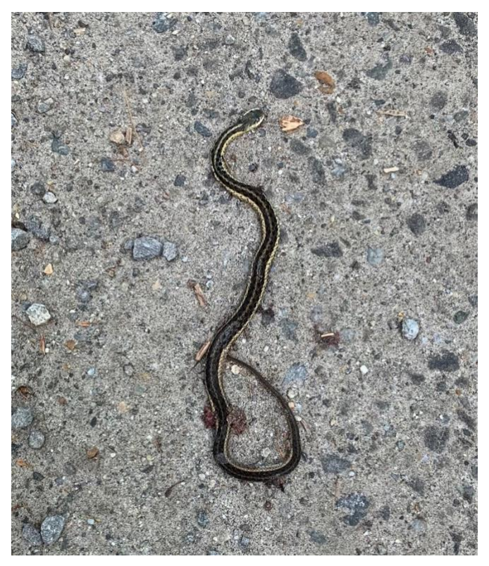
Eastern Garner Snake (Thamnophis sirtalis sirtalis)

And I was moved over the last few years to take pictures of these animals, especially snakes (see photo). I am not sure why snakes in particular; perhaps because I saw many, and couldn't avoid the sight of them lying inert, outstretched, not their usual sleek bodies belly-dancing across the road. I also found out that at least one snake species, the Northern Black Racer ( Coluber constrictor constrictor ), has been classified as 'endangered.' The threat, marked as severe in the Maine 2015 Wildlife Action Plan Revision, stems not insignificantly from roads and railroads. I chanced on an artistic rendering of the species by Arrowsic painter, Jackie Johnson, which the potter Mary McKone from Georgetown used as part of an endangered species pottery line (see photo).