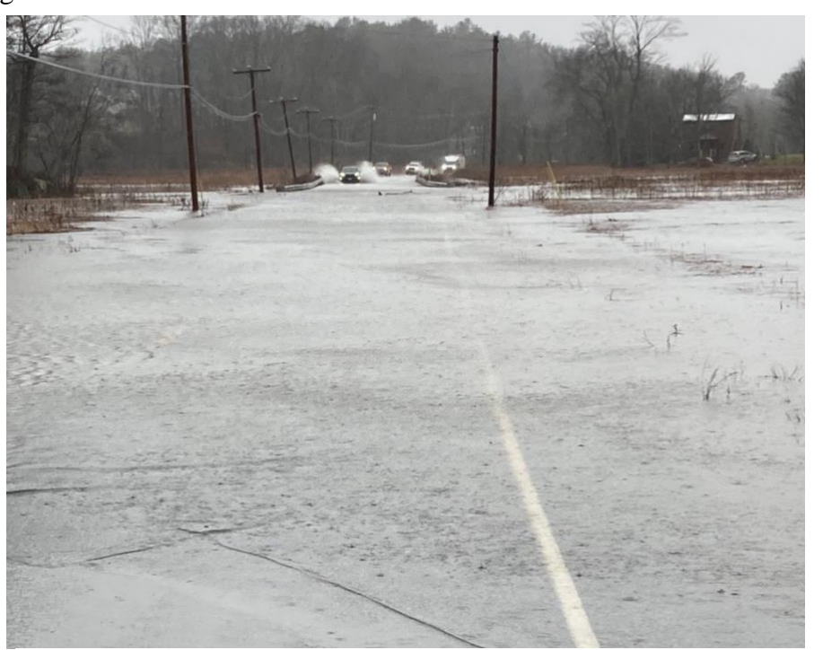
Looking North on Rt 127, Dec 23, 2022

You, too, will help in the creation of the climate action plan! Central to the plan will be your input, which the ACRC will solicit through surveys and during a workshop to be held in September. Further details to come. The town will vote on whether to approve the climate action plan at the town meeting in June 2024.