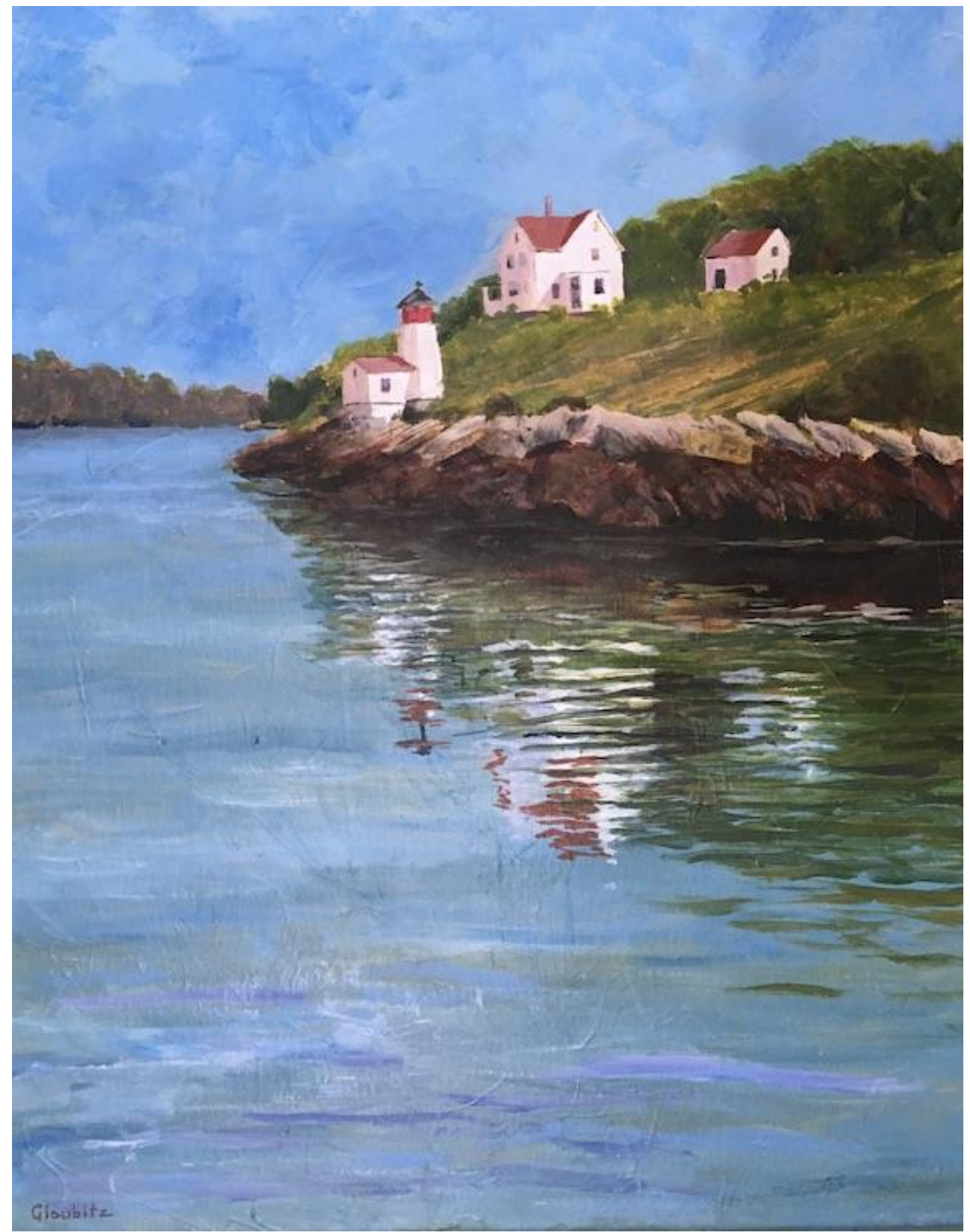
Squirrel Point Reflections by Livy Glaubitz