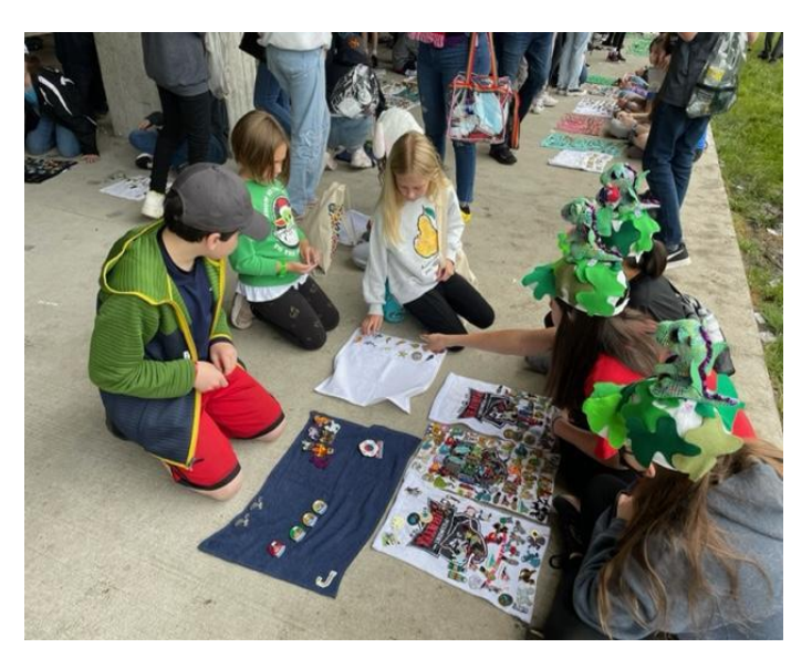
Students Trade State Pins

The teams also each completed a spontaneous problem, where they were tasked with solving a problem as a team without any preparation, which they did successfully. ( Odyssey cont on p 7 )