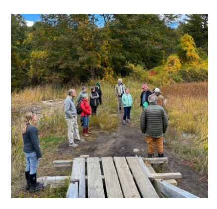
On the trail to Squirrel Point