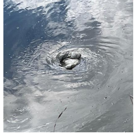
Whirlpool on the low side of an undersized culvert at Indian Rest Rd