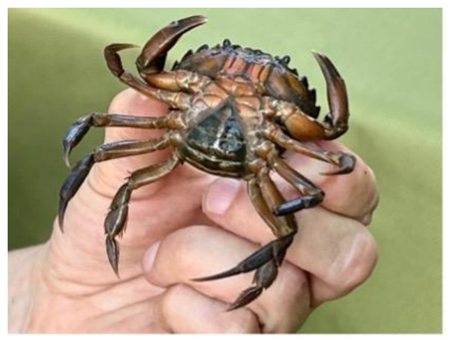
Female Crab

This year the largest catch with 377 crabs was lifted at Fisher eddy. The trap contained 283 females and 94 males. This was also the highest number of crabs ever retrieved from this location. Over the years the numbers of crabs caught in up to twelve traps seem to have increased. The data collection can be found on Arrowsic's website. It appears that the green crabs are here to stay but the data continues to be of anecdotal value because of many inconsistent parameters: time of summer, trap locations, and sometimes, lost equipment. We currently have scientists working on that. If you would like to support the effort and get involved, contact clams@arrowsic.org —Karin Sadtler