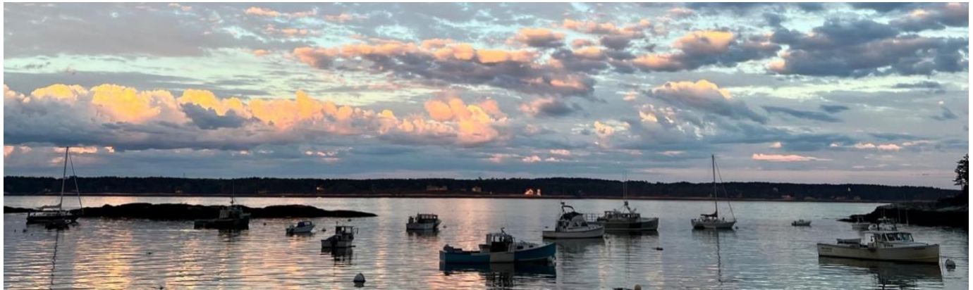
Five island Sunset I