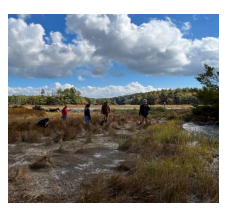
Marsh at Indian Rest Road