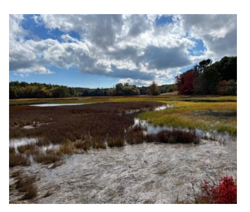
Marsh at Indian Rest Road