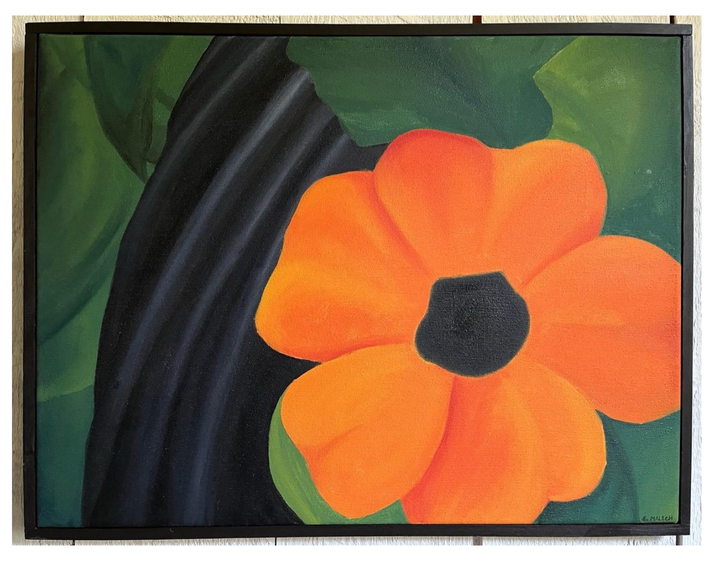
Nasturtium, oil & acrylic on canvas