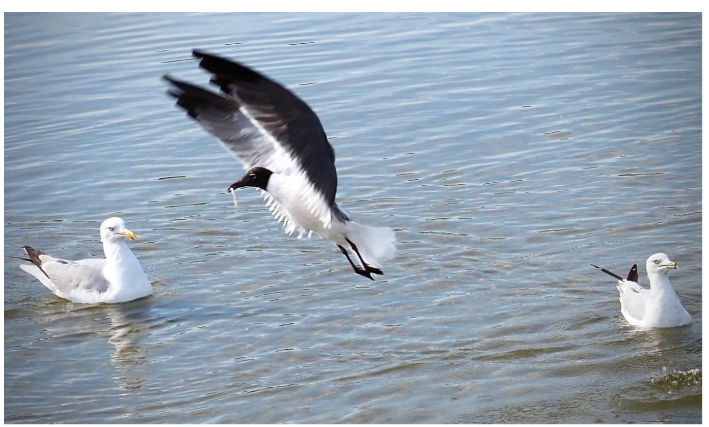
Three species of gulls: From left to right: Herring Gull, Black Headed Gull, and a Ring Billed Gull