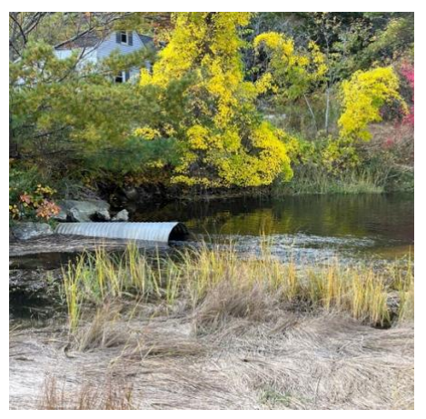
The upside of the same undersized culvert-tide coming in: culvert scour.