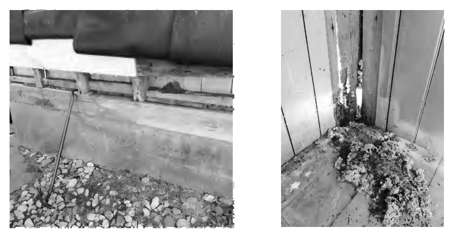
Skillful sill repair (left) and damage to be repaired (right)

2. Fire House Little Barn Heater – With the delivery of the new Minipumper chassis, the Fire Department requested that the Committee make any necessary repairs to the heater in the Small Barn to facilitate storage of the legacy vehicle. In addition, the furnace in Town Hall has not had an annual maintenance in at least two years.