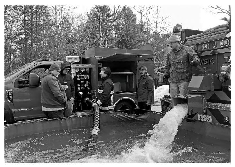
Training on mini - receiving water from tanker

Respectfully submitted, Dale Carlton, Fire Chief