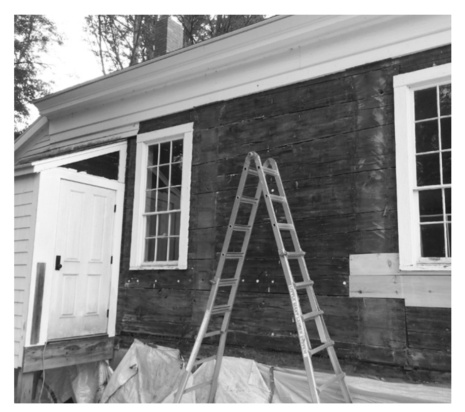
Prepping Town Hall north wall for siding

1. Town Hall Exterior – The renovation of the Town Hall's exterior was completed in the Fall at a total cost of $40,479. As with any project of this magnitude, we are still working through some glitches - but the project was extensive, including replacing the building siding, renovating the windows, replacing the front door, rebuilding the lock to the side door, replacing the North Stairs and repainting the entire structure's exterior.