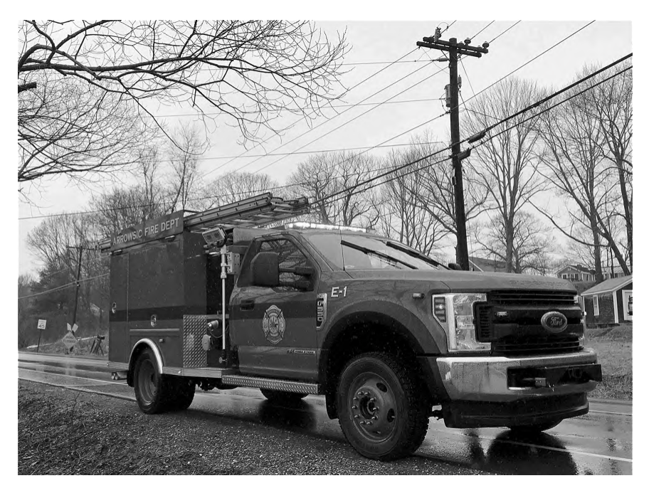
New Engine 1, aka "Milly," on duty

Over the next couple of years we will be deciding what the next step will be to replace the brush truck.